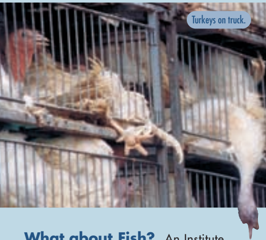
Turkeys on truck.

Transport Crammed together, animals must stand in their own excrement while exposed to extreme weather in open trucks, sometimes freezing to the trailer. 12 These conditions can result in “downers”—animals too sick or weak to walk, even when shocked with electric prods or beaten. Downers are dragged by chains to slaughter or to “dead piles” where they are left to die. 13