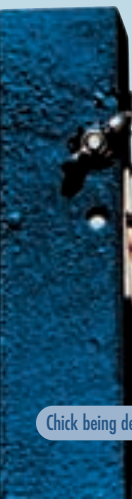
Chick being debeaked.