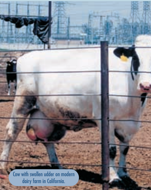
Cow with swollen udder on modern dairy farm in California.

The sows live in tiny cages, so narrow they can't even turn around. They live over metal grates, and their waste is pushed through slats beneath them and flushed into huge pits." 7