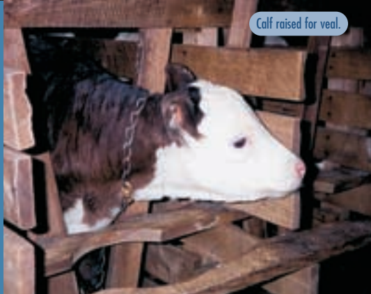
Calf raised for veal.

"Urban Sprawl Benefits Dairies in California" New York Times , 10/22/99