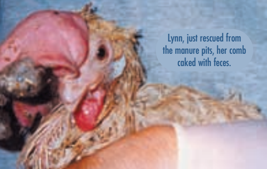
Lynn, just rescued from the manure pits, her comb caked with feces.

With increased knowledge of the behaviour and cognitive abilities of the chicken, has come the realization that the chicken is not an inferior species to be treated merely as a food source.